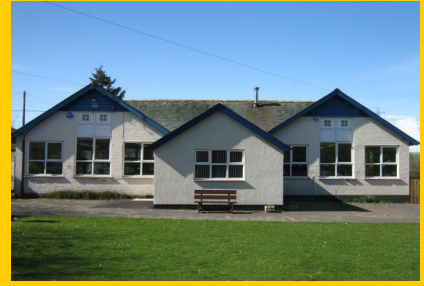
BRANTON COMMUNITY FIRST SCHOOL